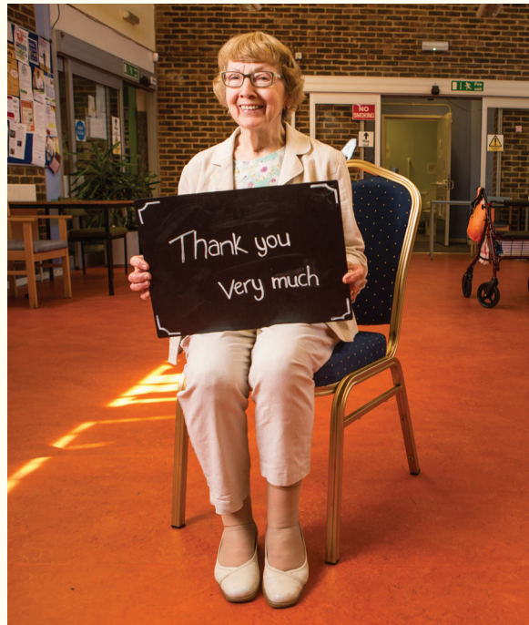
thanks for helping us raise a smile like this

20,000 calls answered to the Age UK Advice Line and 10,000 emergency Winter Warmth packs provided for older people during a cold snap. Or 40,000 calls answered to the Age UK Advice Line from an older person with nowhere to turn.