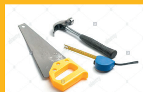
Small Carpentry Jobs