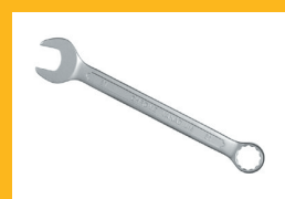
Moving and Assembling Furniture