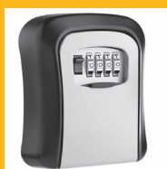
Key-Safes – Supply and Fitting