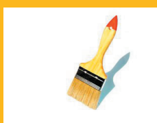
Painting and Decorating