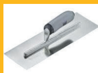
Small Plastering Jobs