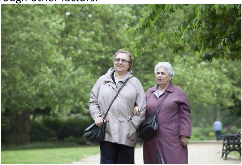
Speed and how quickly you can walk