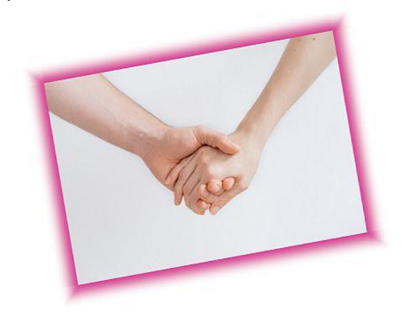
How is your mental health?

The survey also looks to evaluate how far mental health services are meeting the needs of local people.