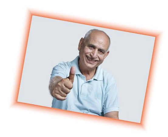
Support a good cause, such as Age UK!

The Local Lottery is a great way for people who want to support our group who may not always have the time to get involved.