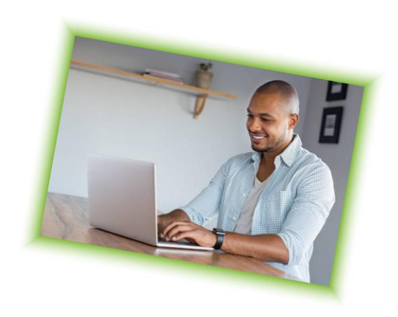
Can you help? Apply today online!

Volunteering is a great way to meet new people, learn new skills and support the work we do in the community. Volunteers are an invaluable part of the work we endeavour to achieve and quite frankly, we couldn't do what we do without volunteers!"