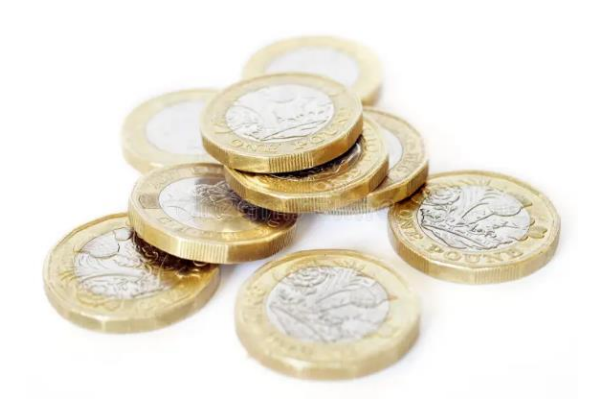
What support could you get?

Check the Citizen's Advice Bureau website, to see what help you could get.