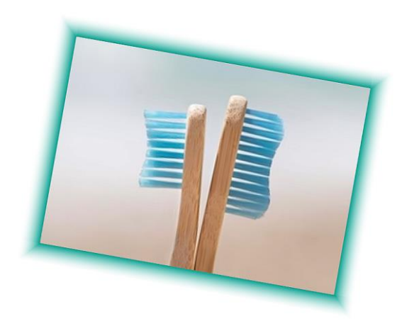
Dentistry is an increasing issue

Our recent poll, conducted with 2,008 adults living in England in January this year, shows modest improvements in some areas. However, the cost of living remains a barrier to health, particularly for those under the most financial pressure and those requiring dental care.