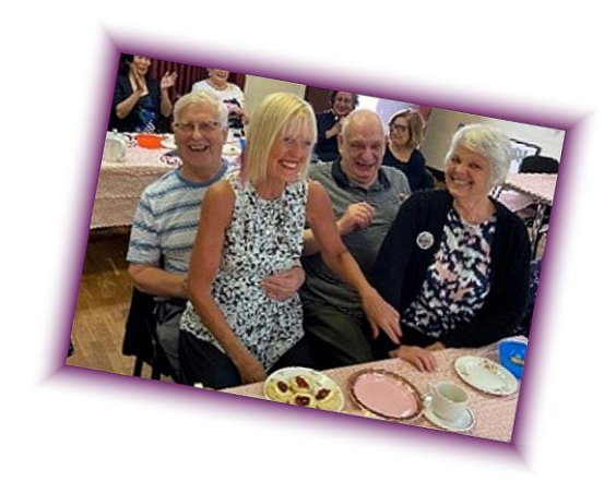
The final event, at Fulwell Cross Library

Havering Adult College hosted a Murder Mystery Event at Queens Theatre for us which had everyone wondering who the murderer was, through a series of clues. Members enjoyed a cream tea sponsored by Co-Op and Roddas while working out who done it!