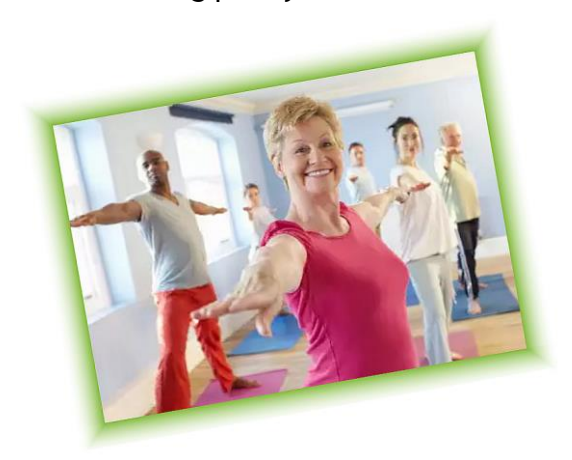
Action packed! Check our website for full details