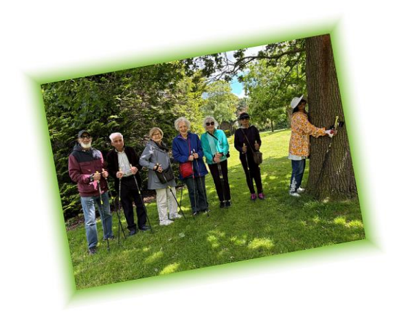
A spot of tree hugging, at the walking group

Falls are the biggest cause of accidents in the home and one in three people over the age of 65 fall each year. This increases to one in two for people aged over 80. The good news is that falls are not an inevitable part of ageing, many can be prevented and our Falls Prevention service is here to help.