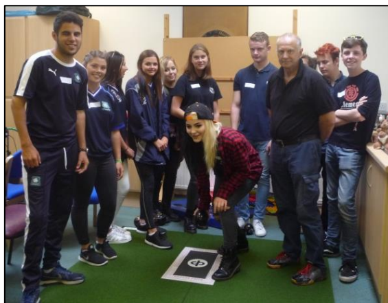
NCS students getting to grips with indoor bowls

Plymouth Argyle Community Trust work with us each year as part of the National Citizens Service scheme which enables young people to volunteer their time and gain skills for the future. Our service users enjoy interacting with them and look forward to their visits.