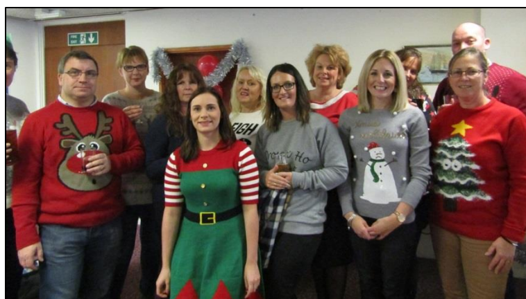
Staff from Santander who raised money to put on a Christmas party for our guests