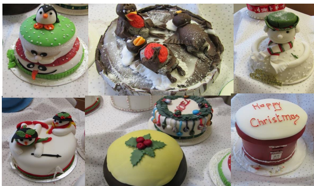
A selection of the wonderful cakes donated by the Sugar Craft Guild

A special mention goes to Devonport High School for Girls who for the 13 th year donated a HUGE amount of food and treats ....which filled our minibus!