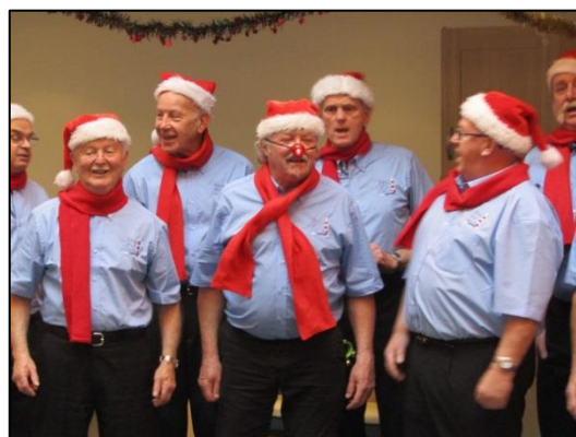
Ocean City Sound getting into the Christmas Spirit!