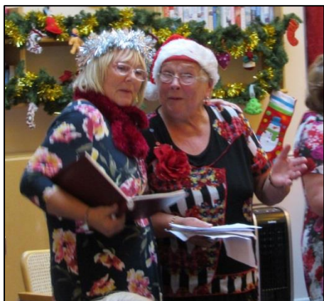
Carers Hub Choir performing at the William & Patricia Venton Centre

We would like to thank everyone who helped to make Christmas fun!