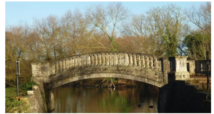
Nearby Iffley lock, a 15 minute walk

Homeshare Oxfordshire carefully matches an older person, or couple, looking for help, companionship or reassurance at home, with another person who is happy to lend a hand, and who needs low-cost accommodation. The Sharer gives the Householder up to 10 hours of their time each week as a combination of companionship and practical help, as agreed. Each party pays a monthly fee to Homeshare Oxfordshire.