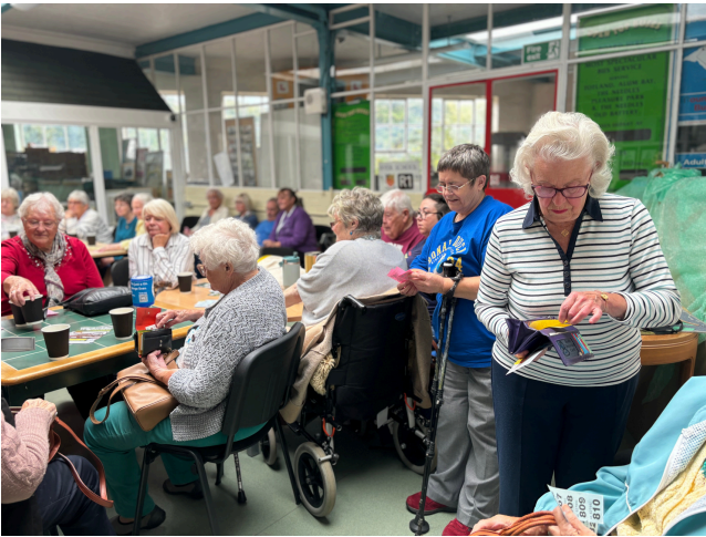
Photo Gallery: A Historic Afternoon at The Isle of Wight Bus and Coach Museum