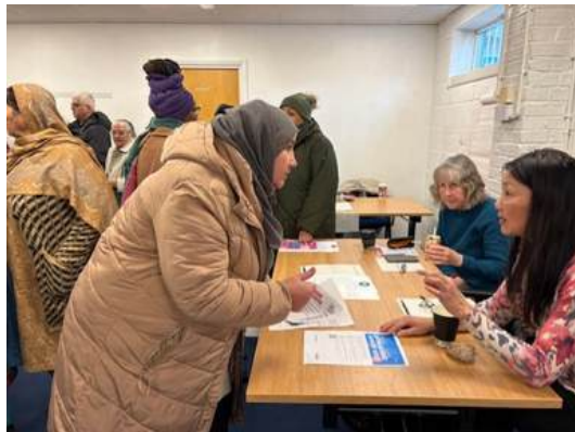
Autism Resident Advisory Group stall