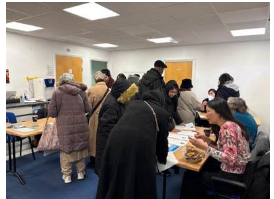
Carers at the NHS Gut Health and Newham Direct Payments stall

Free Will and LPA advice from Diplock Solicitors