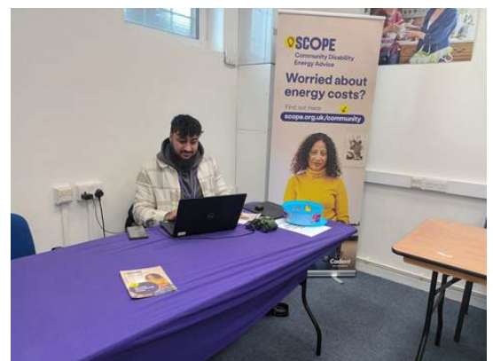
Energy cost advice provided by Scope