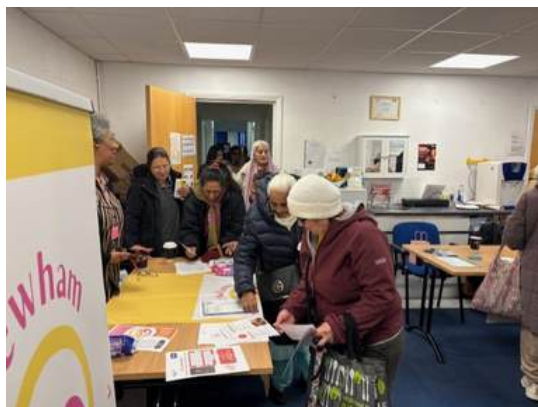
Carers receiving service information from our NCC stall

Free Will and LPA advice from Diplock Solicitors