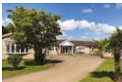
Potton View Care Home Potton Road Gamlingay Cambridgeshire SG19 3LW Tel: 01767 654866