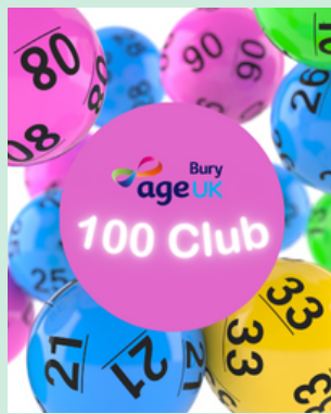
We have 63 members taking part