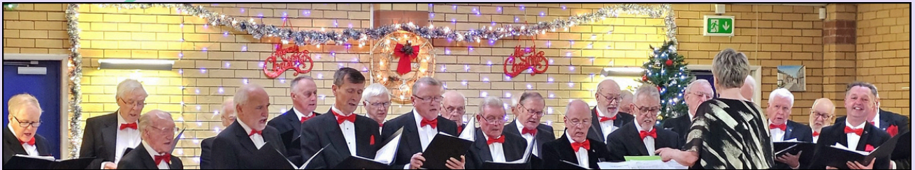
All profits from events goes to supporting people aged 50+ in Bury and surrounding boroughs