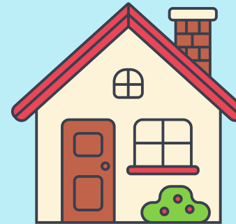
In a house