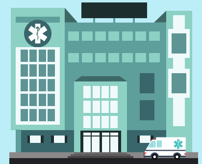
In a hospital